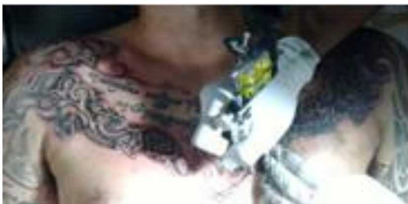
Figure 11. Andrew Tattoo