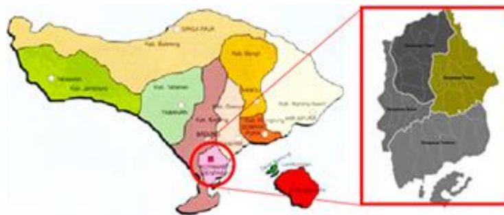
Figure 2. East Denpasar area (green area on the right)

On the topic of tattoo Balinese script using some relevant data collection techniques considering tattoos with Balinese script is relatively difficult, especially in the Balinese themselves. The collection of data based on surveys and literature studies that lead to the topic. Source search is done by purposive sampling so that data can be interpreted and described comparatively. The search data is focused in the area of East Denpasar because in this region began to grow the commercial tattoo industry of repute. The description of the research area can be seen in Figure 2.