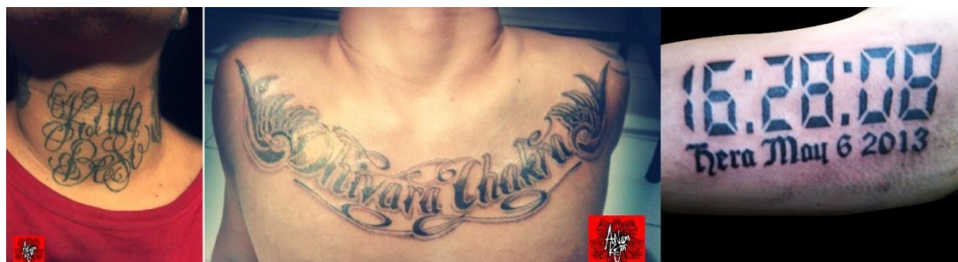
Figure 3. Lettering Tattoo.

Balinese script tattoo is a tattoo that uses Bali letters on the final tattoo. Balinese script has its own rules in writing then the artist is required to understand the text with Bali letters. In the style of painting, painting with ordinary letters called calligraphy or in the form of Bali letters is also called Baligrafi / Balinese calligraphy. In tattoo style, the embodiment of tattoo with the element of the letter is called by lettering tattoo, generally embodied with Latin letters in combination with various letter ornaments as in figure 3.