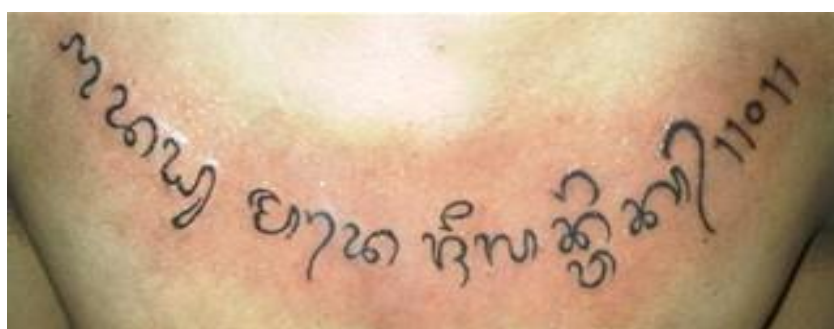
Figure 7. Baskara Tattoo